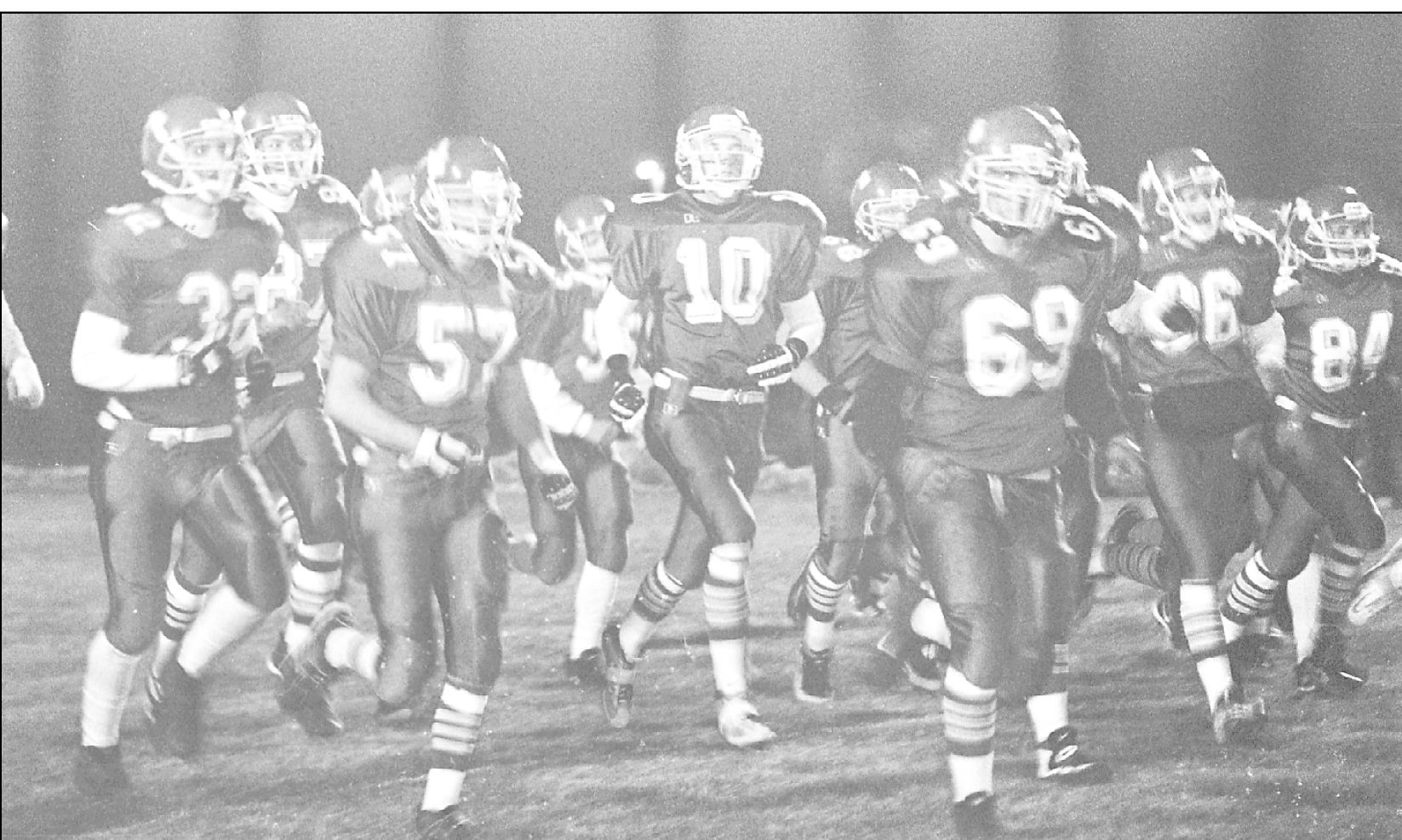
THE SEASON IS OVER but the St. Francis Indians provided excitement throughout the fall as they racked up a 6-3 win/loss record. Individual contributions were made by different players.