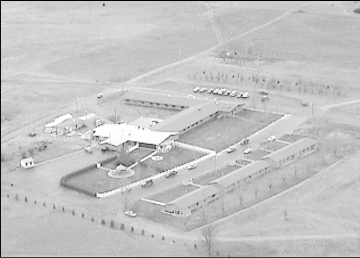
Aerial photo of the St. Francis Good Samaritan Village today