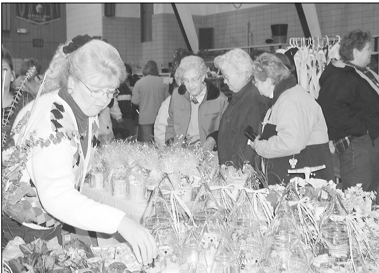
VENDORS PROVIDED many items for shoppers to choose from.