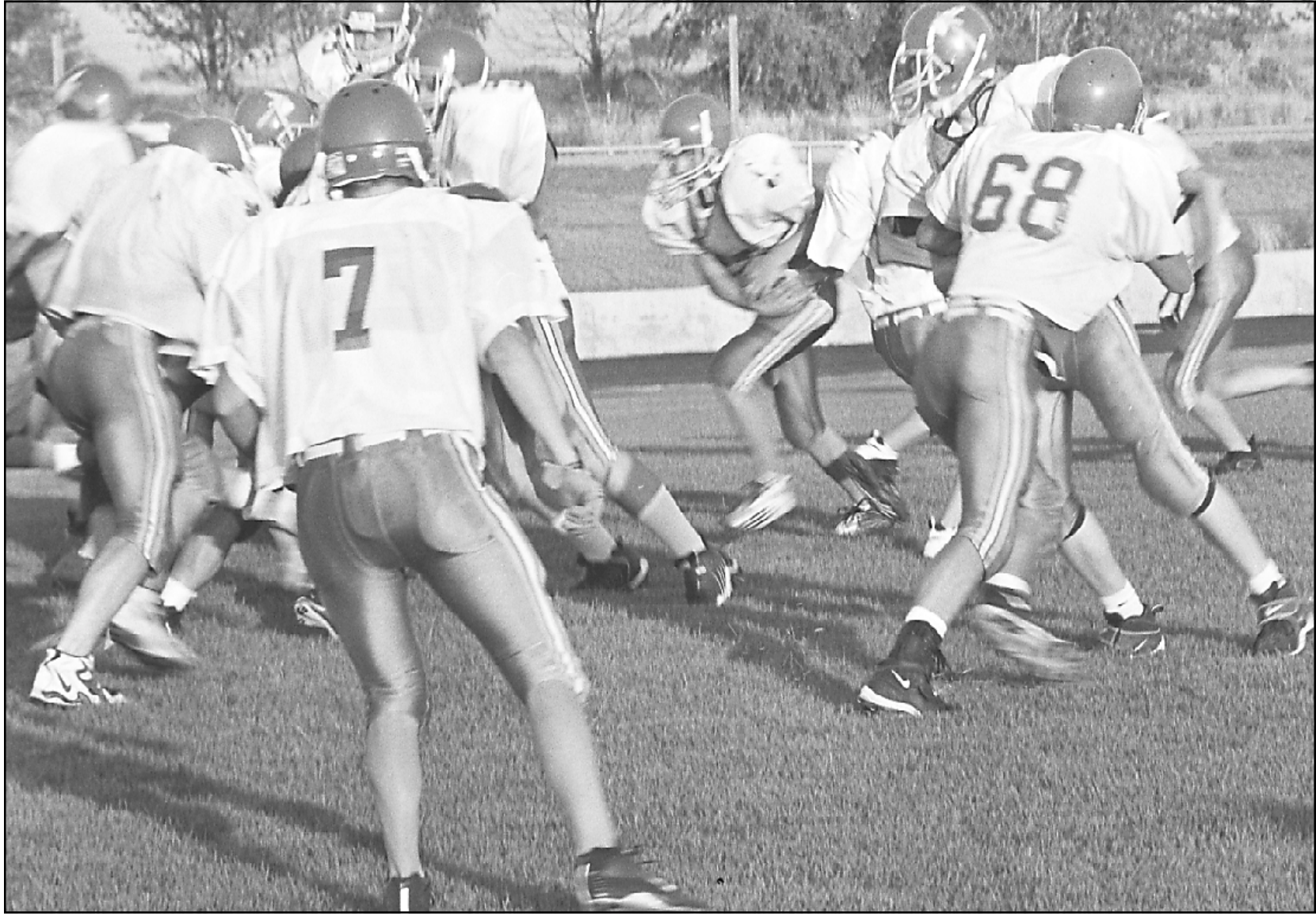
INDIANS PREPARE for contest with Bridgeport on Friday night by practicing their offensive moves before parents and other fans at the open house. The team members were introduced prior to the scrimmage.