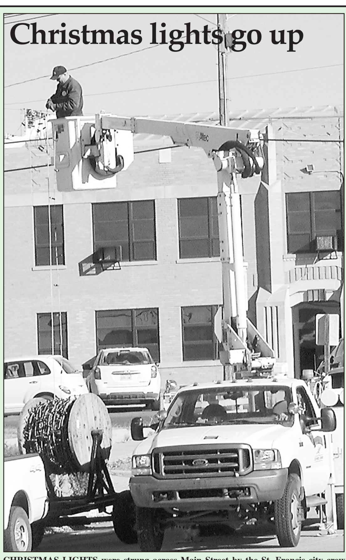
CHRISTMAS LIGHTS were strung across Main Street by the St. Francis city crew while the weather was nice on Monday and Tuesday. Earlier in the day on Monday, they were found in the city shop checking strings of lights and replacing bulbs. St. Francis probably has one of the prettiest Main Streets during the holidays and it is due to the city crew's efforts. Tell them thanks!

Everyone come out to the Parade of Lights to kick off the Christmas season!