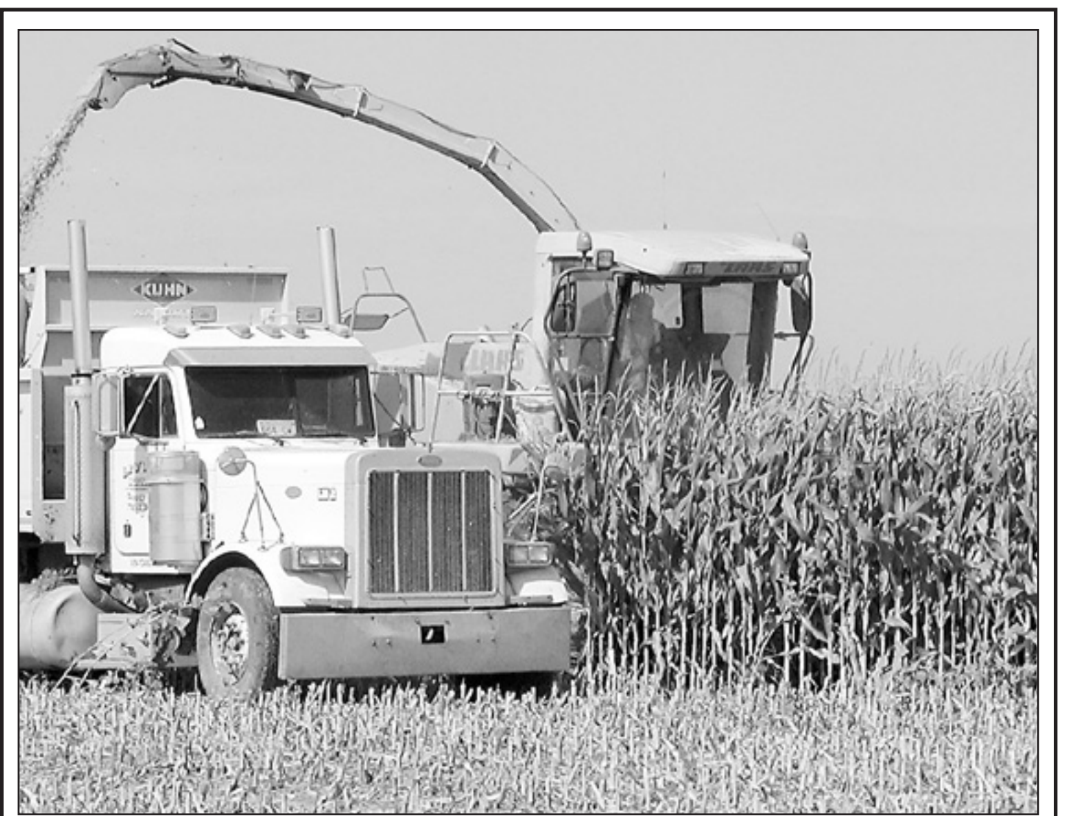
INSILAGE WAS BEING CHOPPED north of Bird City. It was delivered to the Bird City Dairy. Insilage harvest is a sure sign that fall is near.