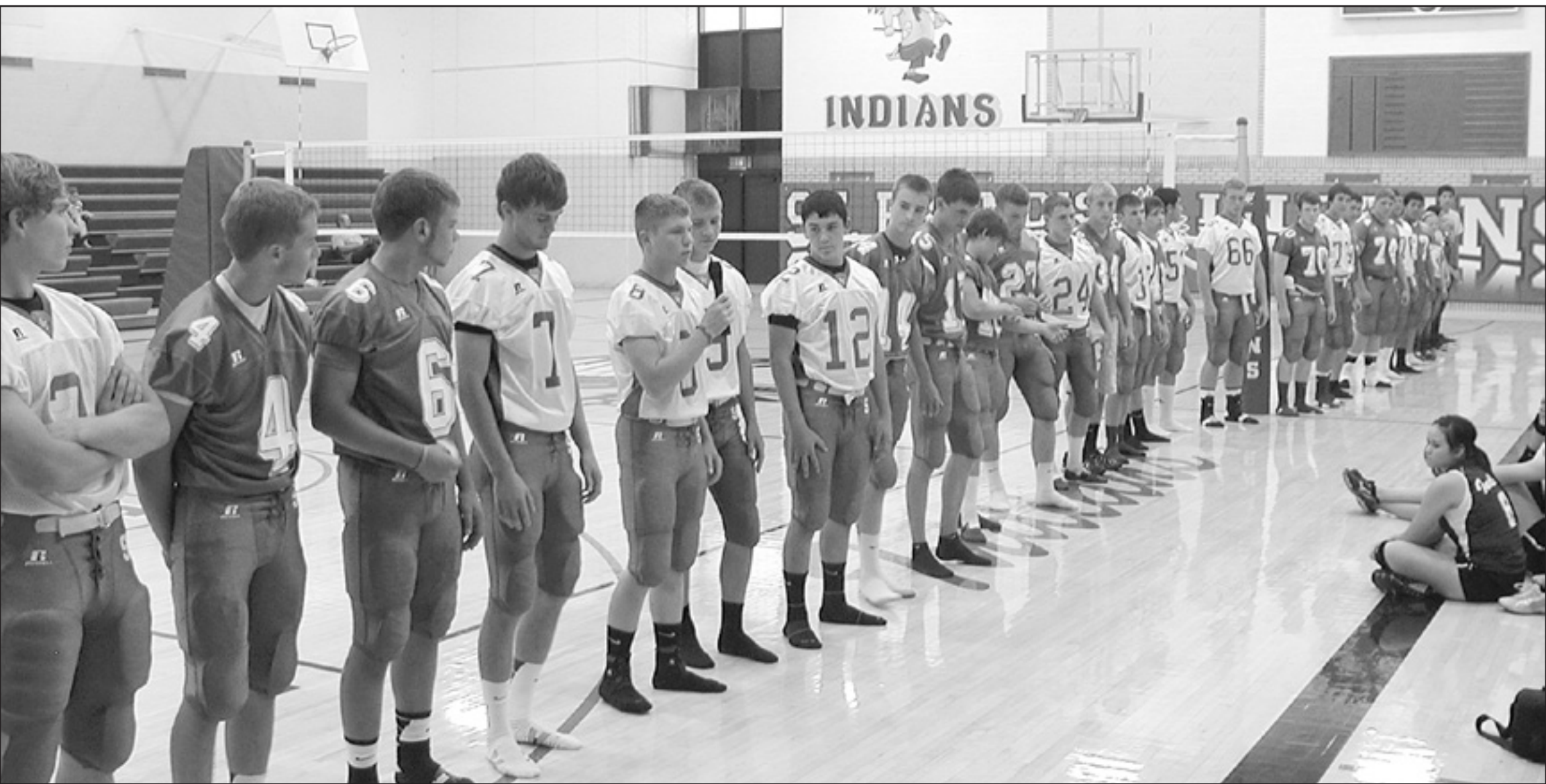
THE 2013 FOOTBALL team introduces themselves at the open house held on Friday night.