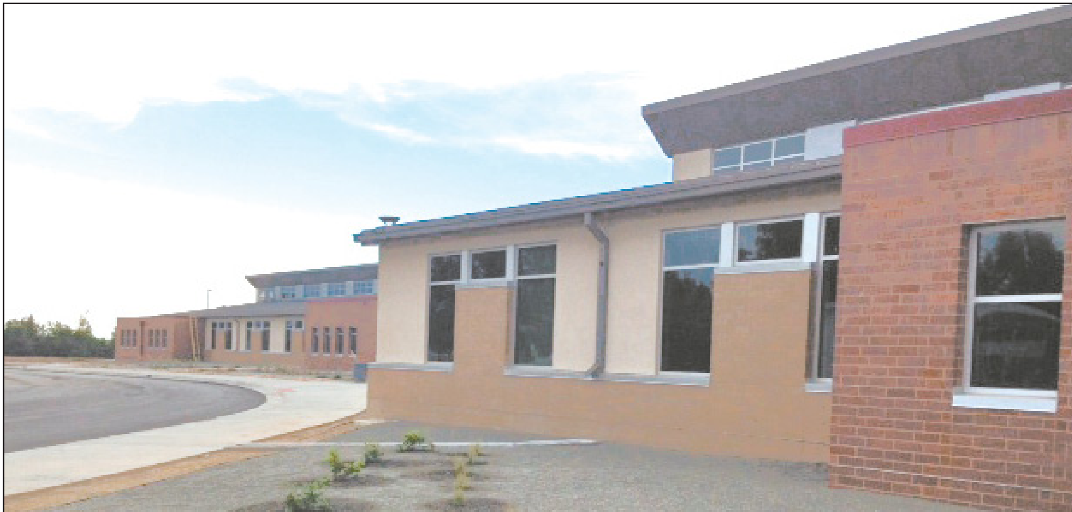
IDALIA BUILT a new school using grant funds and local tax money. The school will open for classes on Aug. 22.