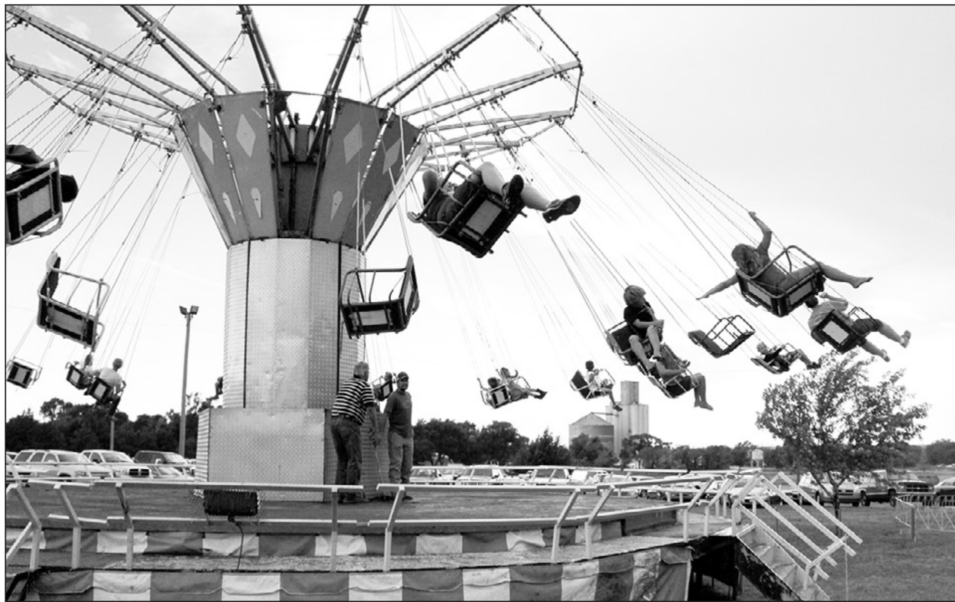
The carnival rides were popular during the Cheyenne County Fair. There are two swings – an adult and a kids.