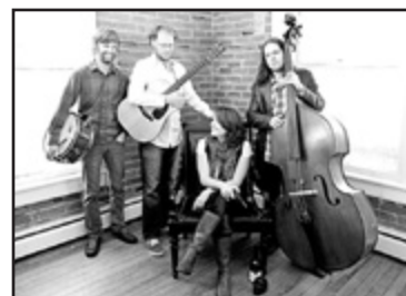
Monocle Band From Boulder, CO