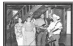
Two-Bricks Short From Burlington, CO.

* Meals available in the park * Bring your lawn chairs