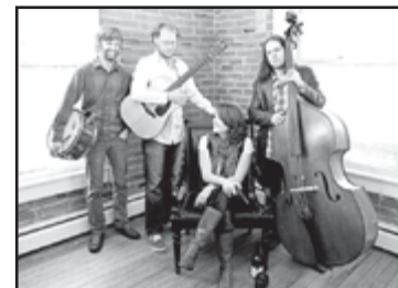
Monocle Band From Boulder, CO