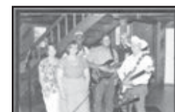
Two-Bricks Short From Burlington, CO.

Free-will donations accepted! Proceeds go towards village improvements and continuing the HIC scholarship Presented by: Haigler Improvement Committee