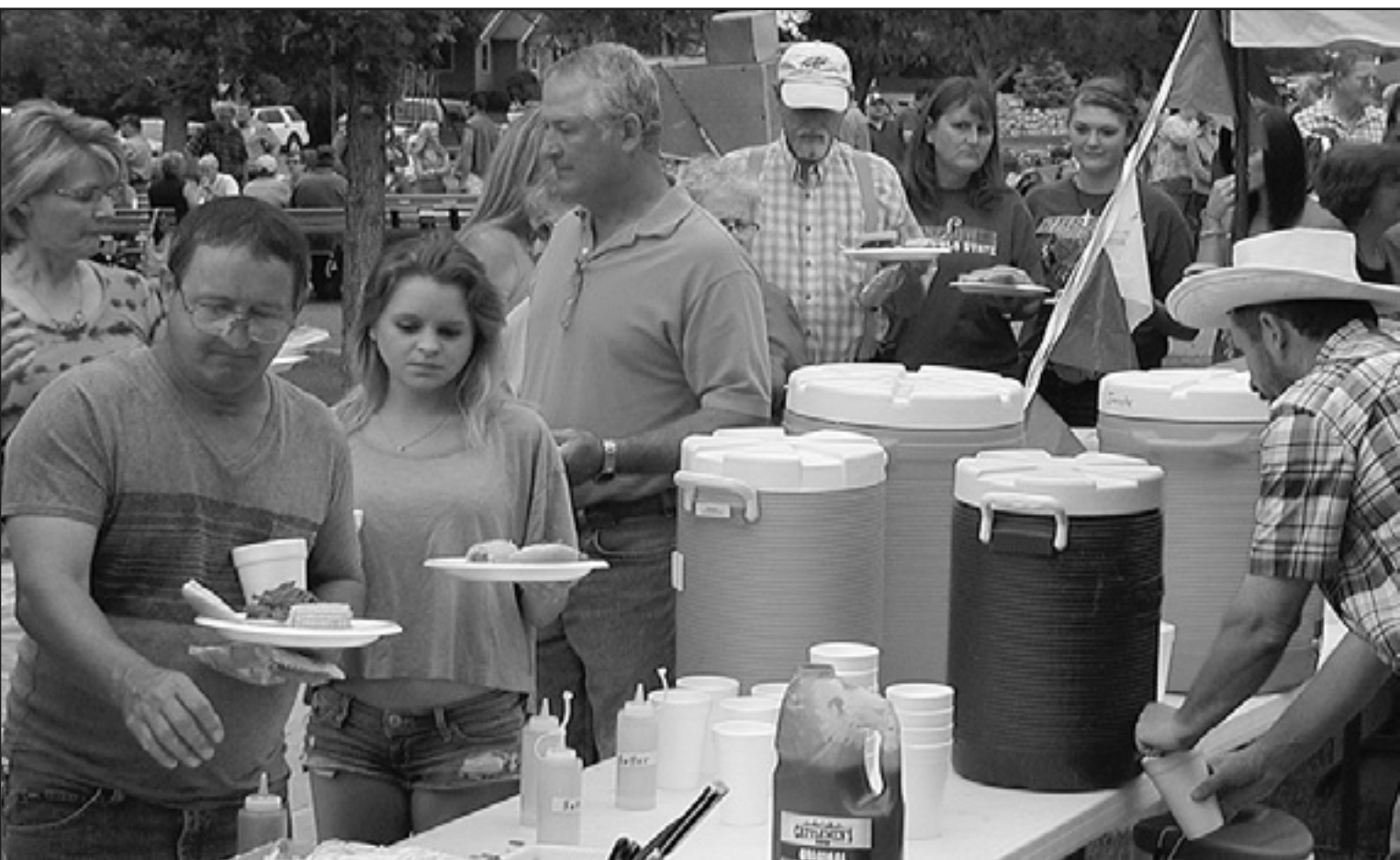
THE LINES WERE LONG but moved quickly as around 800 people were served at the barbecue held in conjunction with the 125th St. Francis Birthday Celebration on Friday.