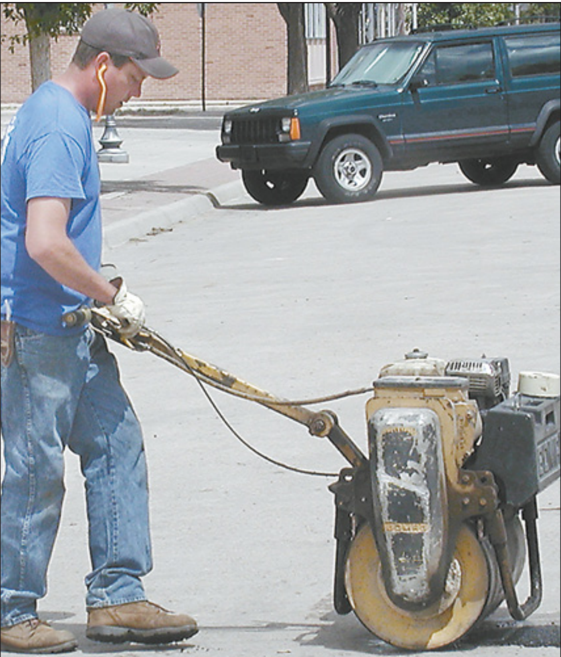
THE CITY CREW has been busy getting St. Francis spruced up and ready for all the visitors expected for the 125th Birthday Celebration which starts Friday. The park is mowed, real flowers will be put in the planters and store fronts are neat.