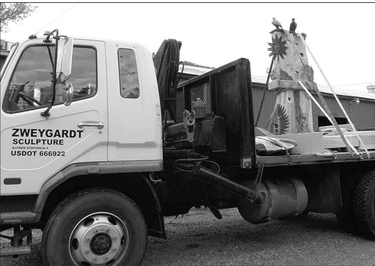
GLENN ZWEYGARDT'S Art is loaded on the truck and ready to go to the Salina show. Glenn will be displaying art in St. Francis during the 125th Celebration to be held in June.