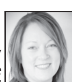
By Bernadette Luncsford