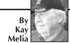
By Kay Melia

I wish I knew more about tomatoes. I wish I knew enough about the overall gardening aspects of growing perfect tomatoes. I wish I could guide you through a program of unmistakable success of tomato growing in your backyard garden. But I can't do that. There are too many variables. Please understand that I am reasonably happy with my own tomato crop out in the backyard. Not giddy. Just happy. I've been doing it long enough to know a few things about what needs to be done and what you should not do to achieve top tomato production. But I also know that there are many aspects of tomato culture that I just don't comprehend. And when push