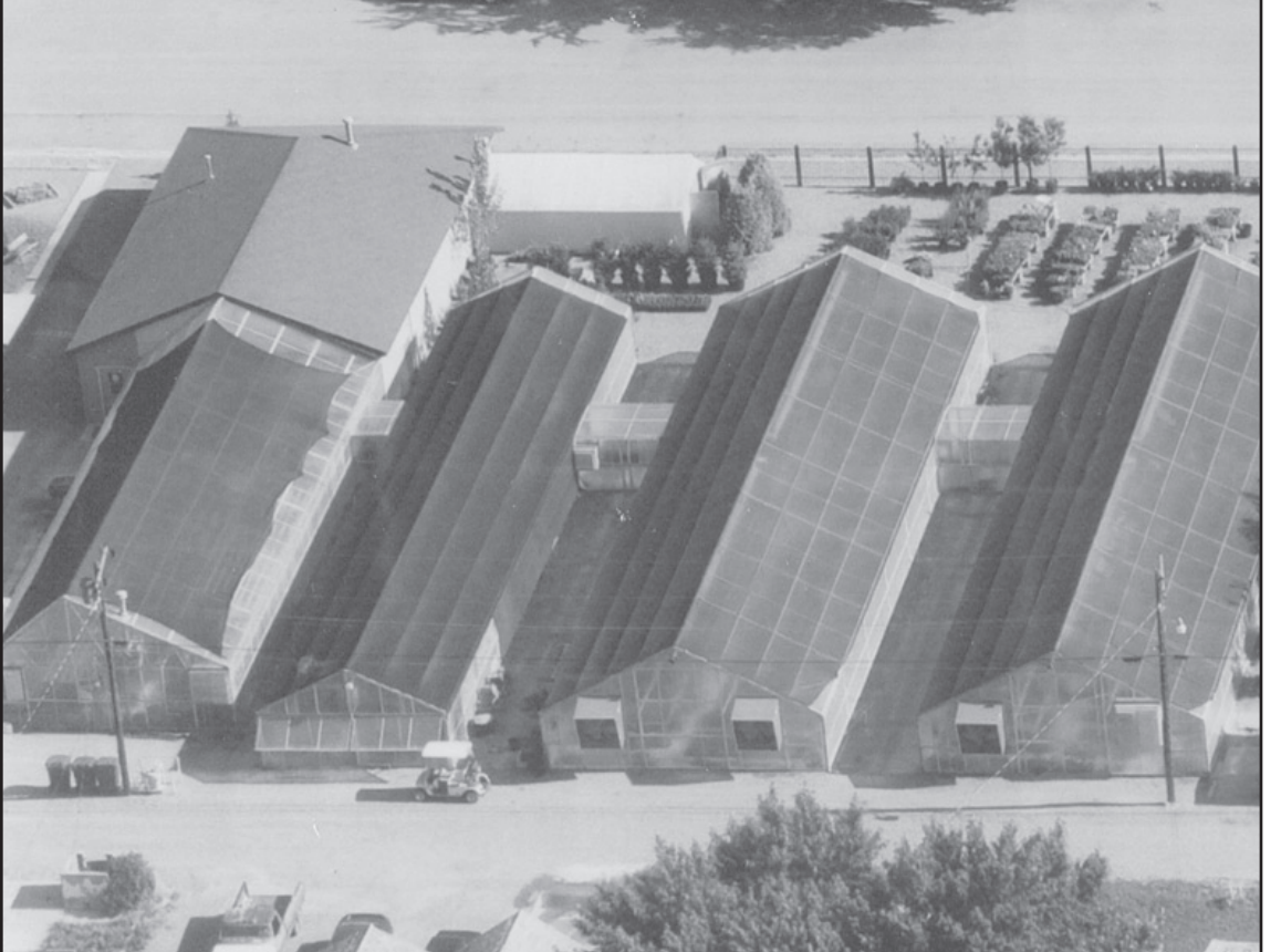
Aerial shot of the greenhouse purchased by the St. Francis Community Garden.