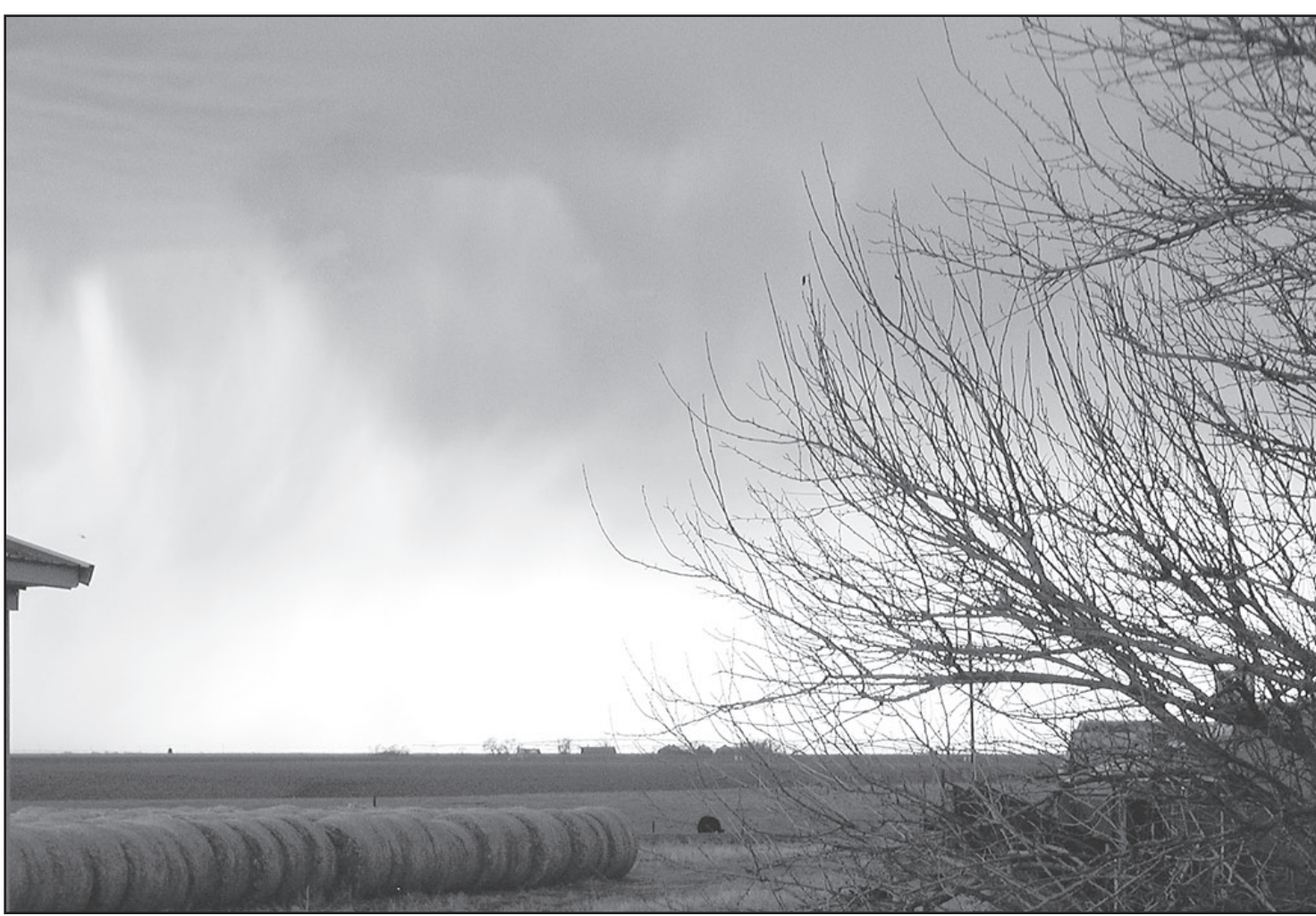
STORM CLOUDS pass through the area on Saturday.