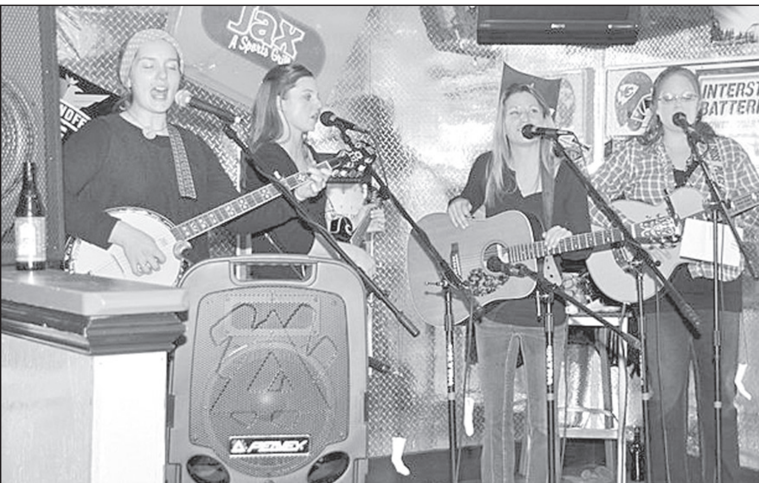
FRESH PICKED PARSLEY, a band to perform during the Reflex Sympathetic Dystrophy Cure benefit set for April 27.