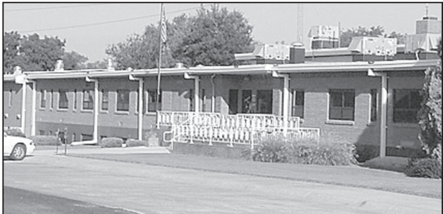
Cheyenne County Hospital