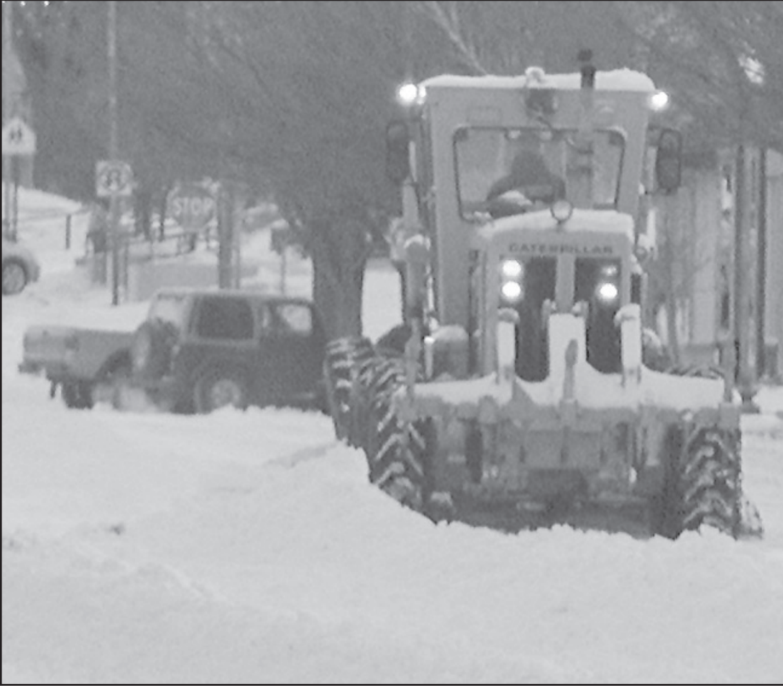
GRADER brought in to clean the snow from Main street.