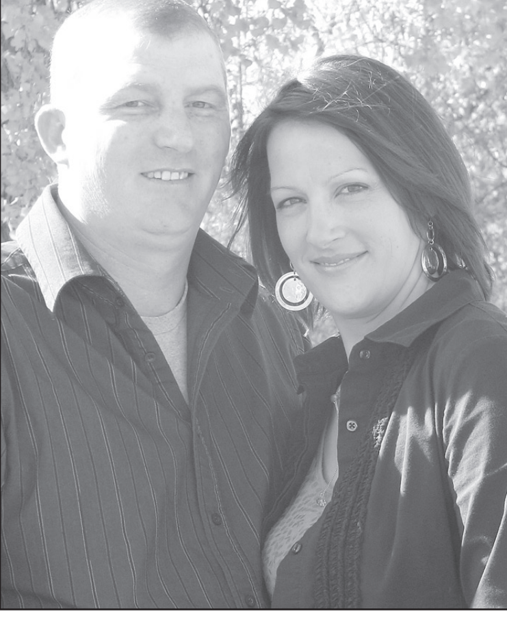
Sharp and Verde