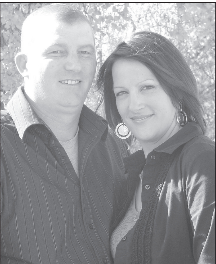
Sharp and Verde