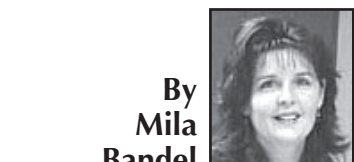
By Mila Bandel

Nearly all people six months and older are recommended to receive