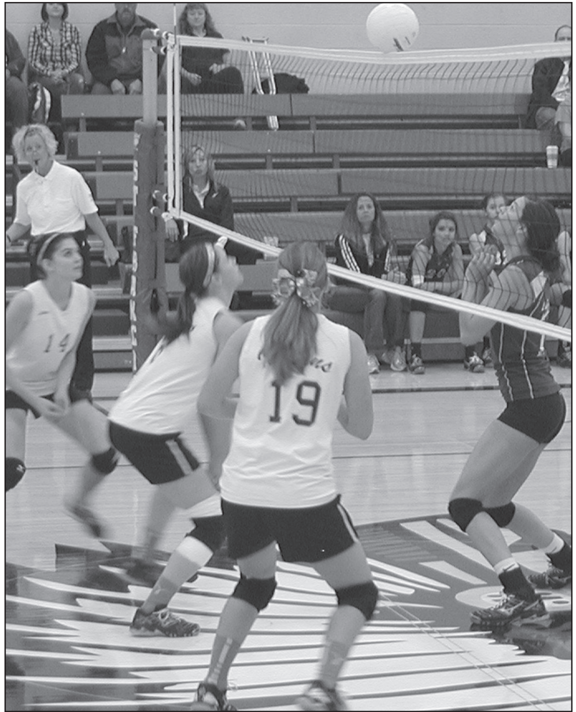
SAINTY VOLLEYBALL players set themselves while waiting on the ball during last Saturday's match against the Holyoke Lady Dragons.

The team will travel to Oakley on Saturday to participate in the Northwest Kansas League Tournament, beginning at 10 a.m.