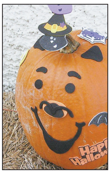
DECORATED PUMPKINS are among the activities planned during the Haigler Fall Festival.

Schedule of events include neighborhood garage sales from 9 a.m.-noon MDT. Maps will be available at 'the station' on U.S. 34. Vendor booths with sales on jewelry, candy, beauty items and decor sales will be held at the Golden Inn Senior Center. Tables filled with pumpkins of all sizes (plain or decorated); jams, jellies,