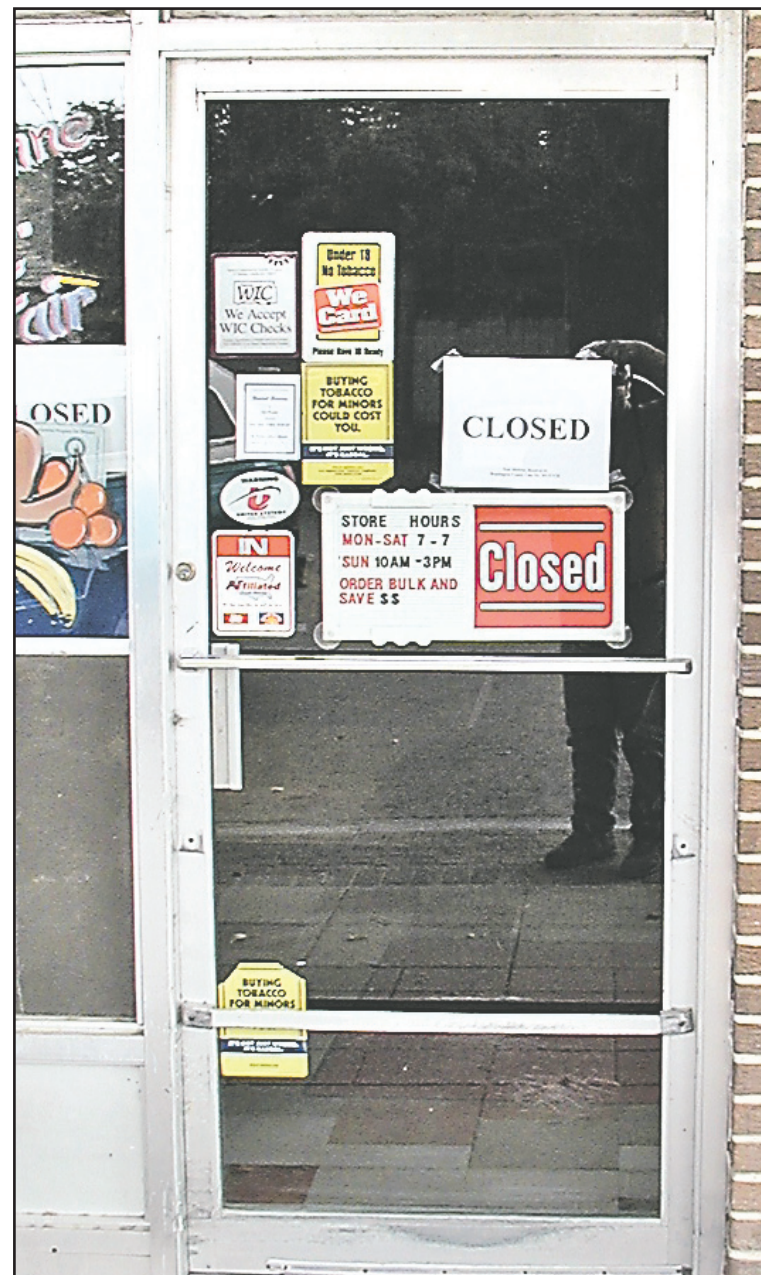
FOR THE THIRD time since the first of the year, Bella Supermarket doors were closed again.

After registering, the registration will continue to be valid until the voter changes their name by marriage, divorce or legal proceedings or changes their place of residence.