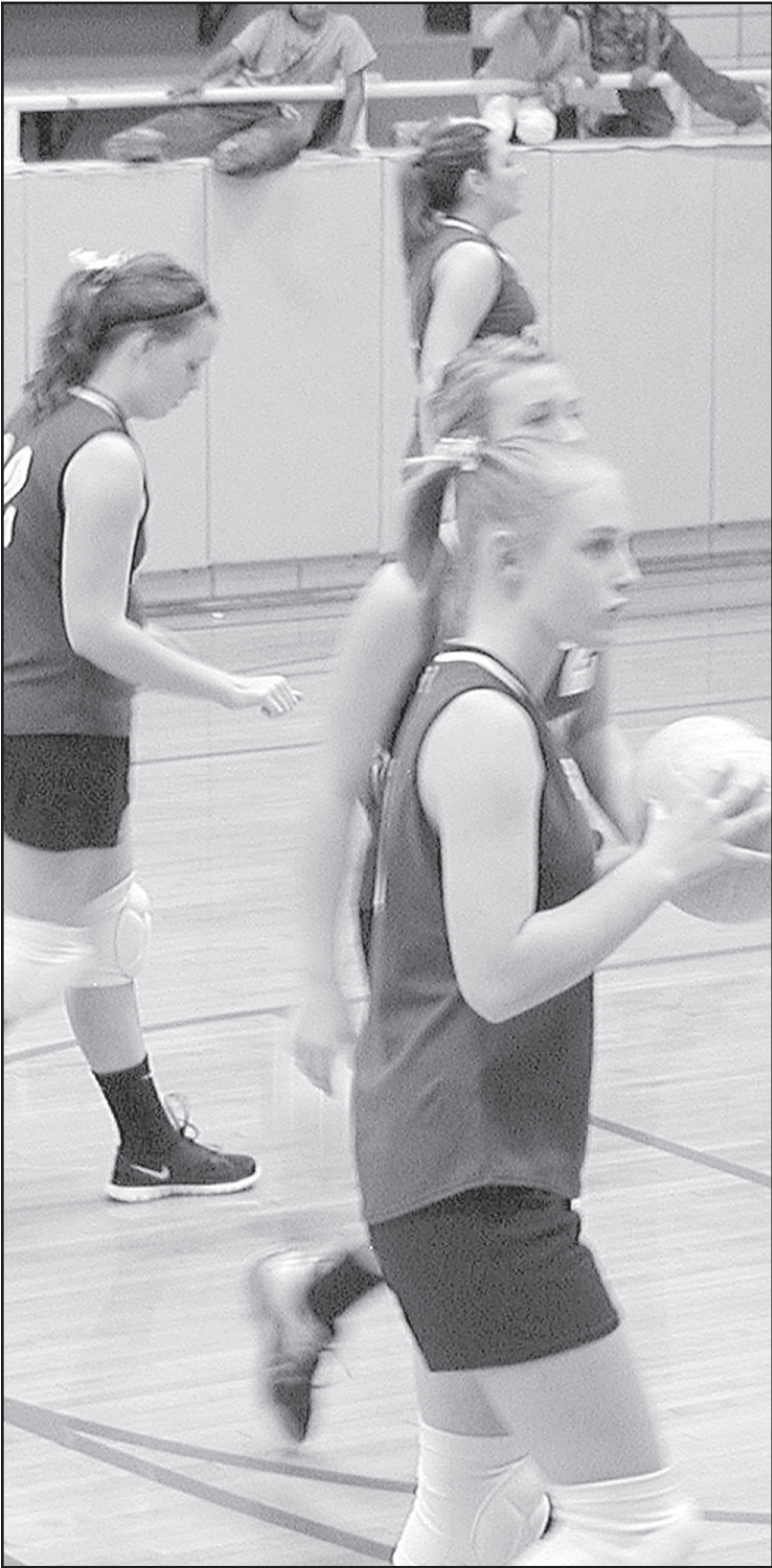
MEMBERS OF the junior high volleyball team practice in the grade school gym last Thursday.