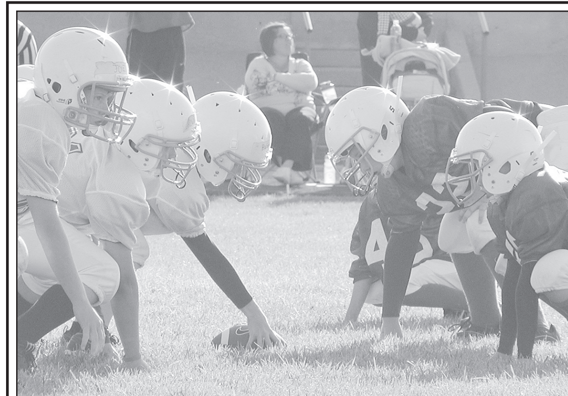
KIDS IN grades 4-6 from St. Francis and Wray line up against each other to play football last Saturday.

Future articles will give details about how to get involved.