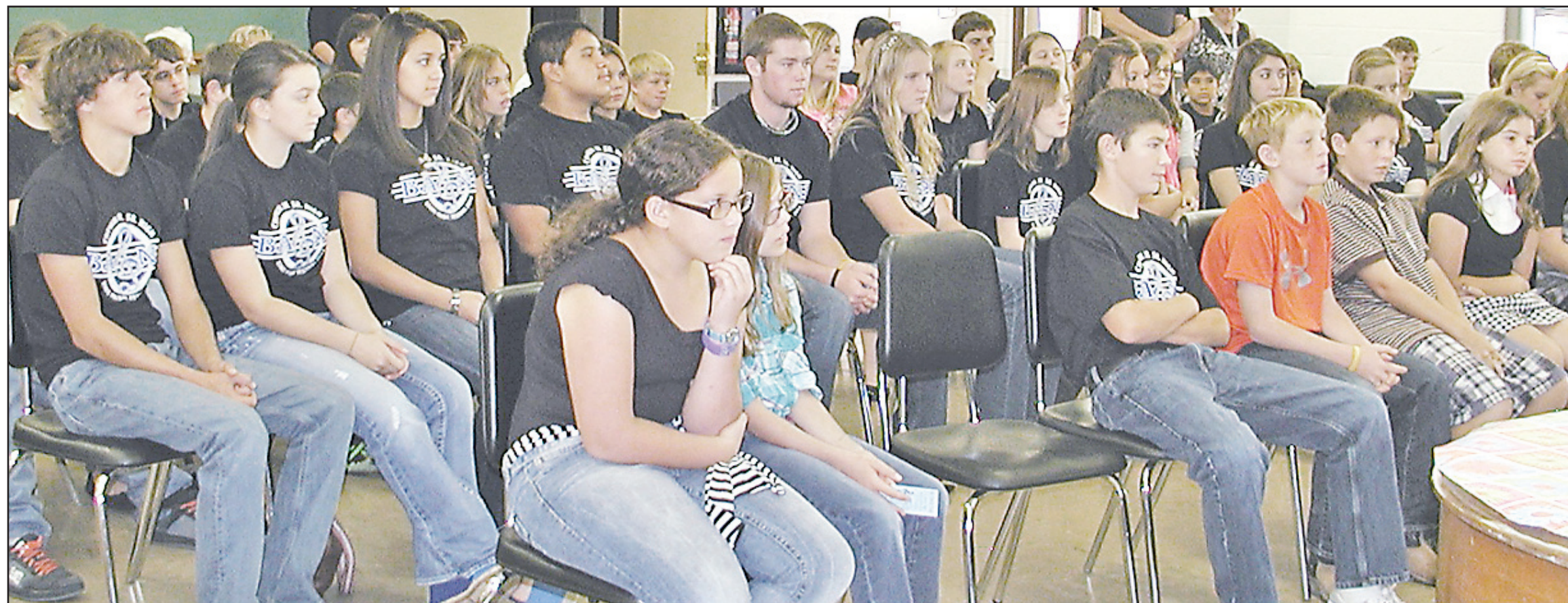
AROUND 60 STUDENTS attended the workshop performed by the Denver Brass 5 ensemble on Sunday. Many thought the music to be 'awesome' and were glad they could come.