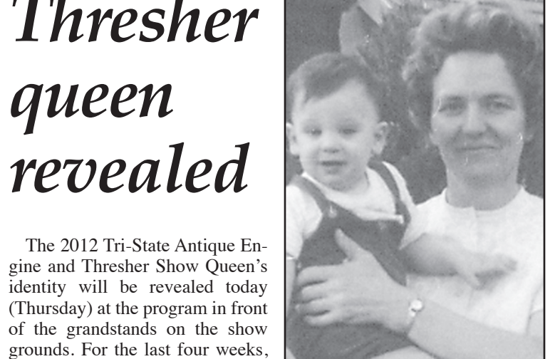
2012 Thresher Oueen

and times listed are for central time. All programs are subject to change. Please check the program booklet which will be printed later this sum mer for more definite information.