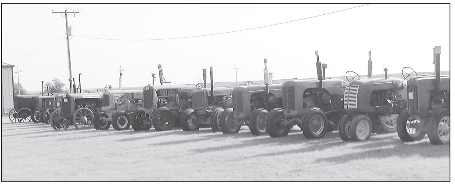
ANTIQUE TRACTORS are lined up and ready for this year's Tri-State Antique Engine and Thresher Show in Bird City.

The Thresher Show special section, inserted in the Times and Herald , is full of information and history of the show. Be sure to check out this special section and thank the advertisers who made it possible.