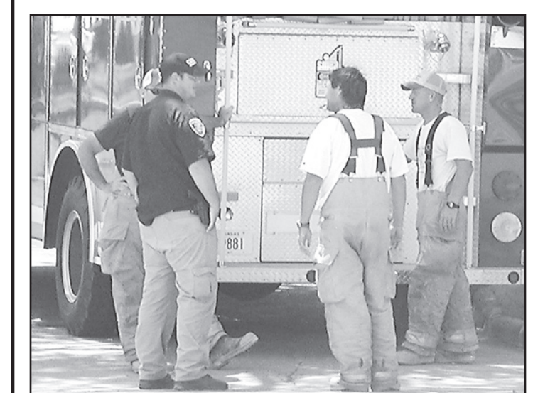
FIREMEN and law officers were called to a house fire on Francis Street in St. Francis.

In order to receive the tax rebate, all taxes due must be paid in full, including taxes owed on all properties of the owner. Should a property owner fail to pay the taxes owed, participation in the program will be forfeited for the remaining term.