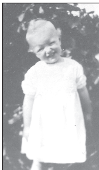
2013 Thresher Queen

The 59th Tri-State Antique Engine and Thresher Show will be held July 26 through 28