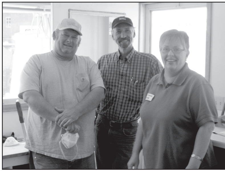
Owned by the farmers and ranchers of this community since 1913

He Delivered the St. Francis Equity's First Load of Wheat for the 2012 Harvest.