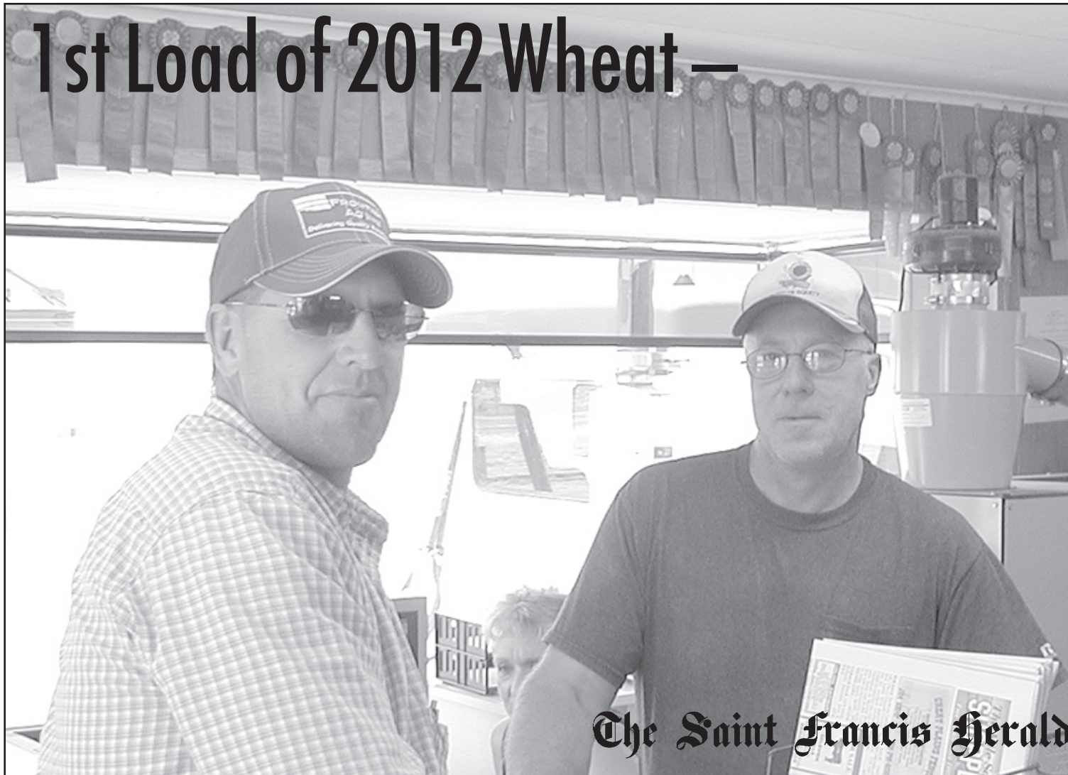
The Saint Francis Herald