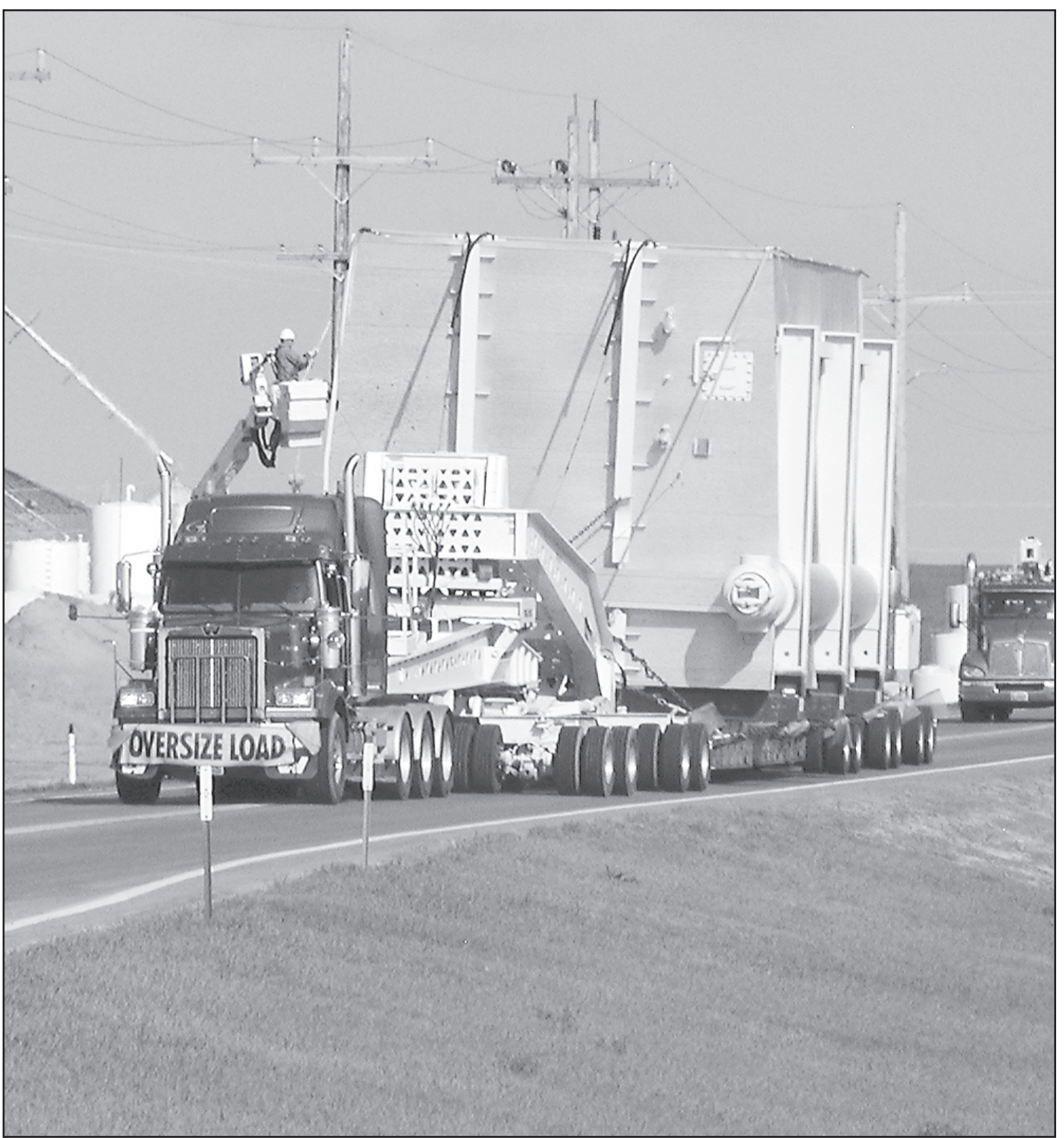
OVERSIZED LOAD travels through the area on U.S. Highway 36 on the way to Canada.