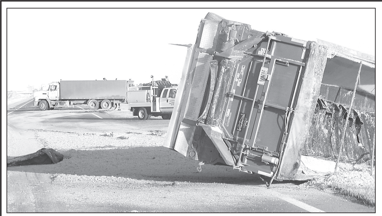
truck with trailer over corrected and ended up rolling. The accident happened Thursday on U.S. 36 between Wheeler hospital and later released.