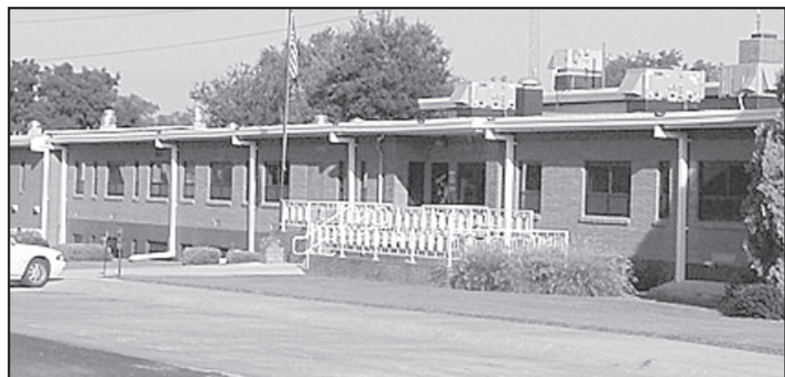
Cheyenne County Hospital