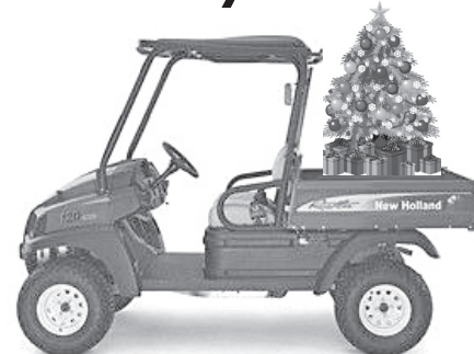
New Holland Rustler 125

She'll be anxious to use it to Fix Fence!! You can also use it to get the mail!