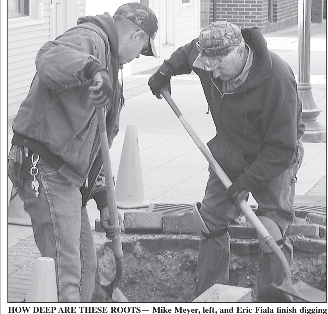
out a dead tree on main street.

2002 Dodge 1500 Quad Cab, SLT Plus, 103K, #T63828