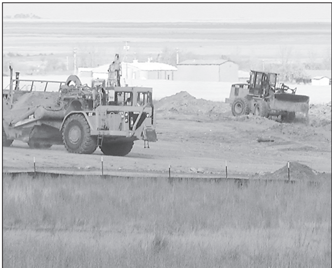
DIRT WORK IS going on at the Cheyenne County Airport for the expanded runway project.