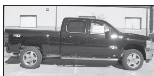
2011 Chevy 3/4 Ton Crew Cab, Diesel, Black, Leather, LTZ PKG (New)

F. G. D. Going on now at Vince's GM Center. That's right Frightfully Good Deals..with up to $4505 Customer cash or 0% up to 72 months on select models. We also have a great selection of pre-owned vehicle's..