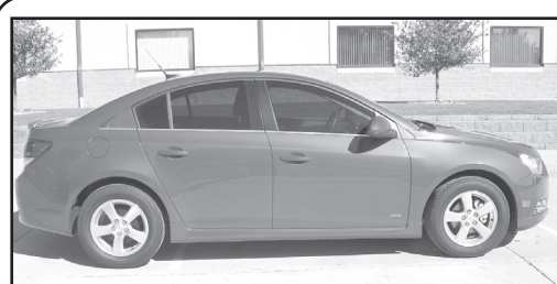
2011 Chevy Cruze, Red, Cloth, Xm Radio, (Pre-Owned)