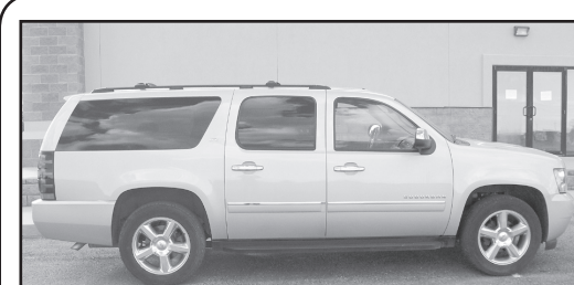
2010 Chevy Suburban, Gold, Leather, Sunroof, Dvd Player (Pre-Owned)

thought to ponder...If you bear a child, why do you have a cow?