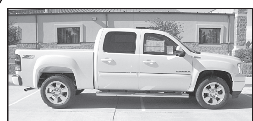
2011 GMC 1/2 Ton Crew Cab, White, Cloth, All Terrain PKG (New)