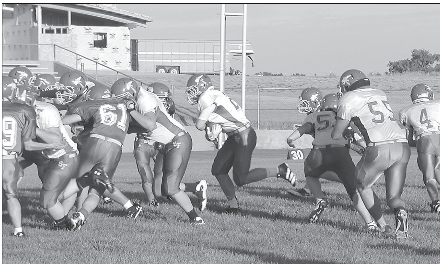
THE FOOTBALL team plays during the soap scrimmage held on Friday night at Greene Field.