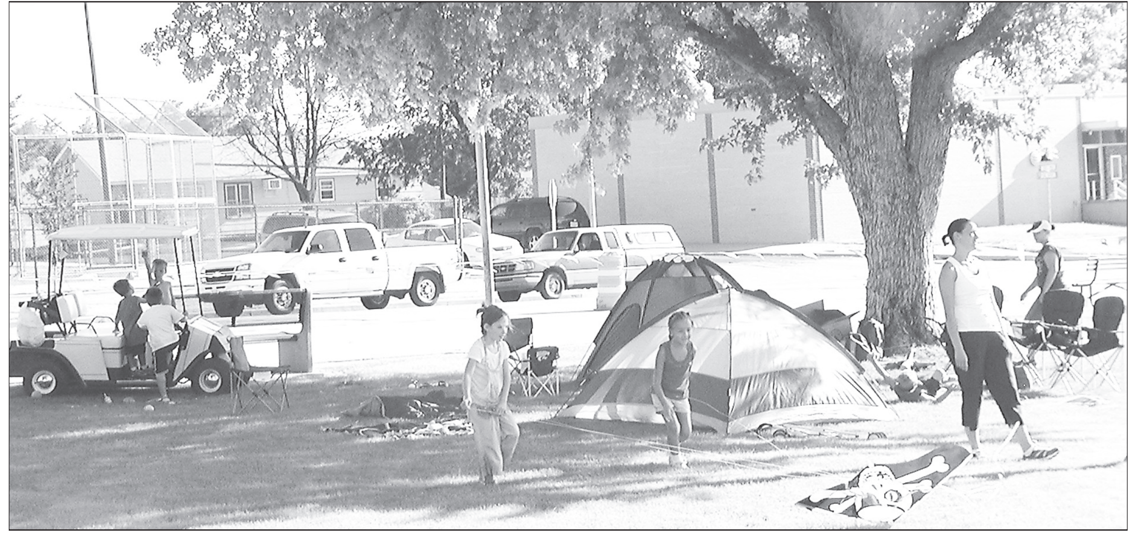
TENTS IN THE PARK marks that the Relay for Life cancer walk is getting ready to begin. Children were busy entertaining themselves by playing and trying to fly kites.