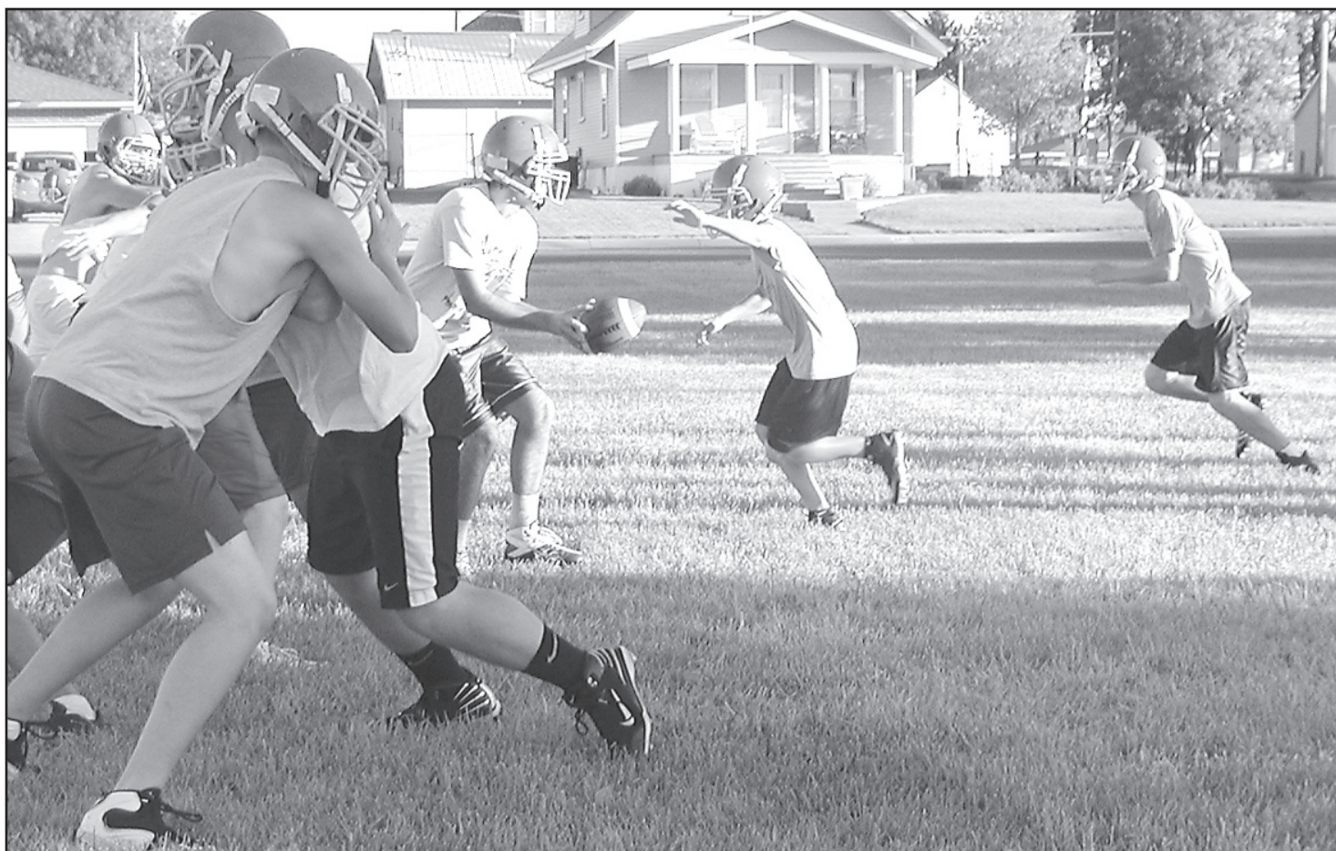
FOOTBALL CAMP —Indian football camps were held in St. Francis the week of June 6. The players were anxious to participate.