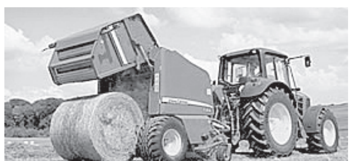
Beef Moooves John Deere!