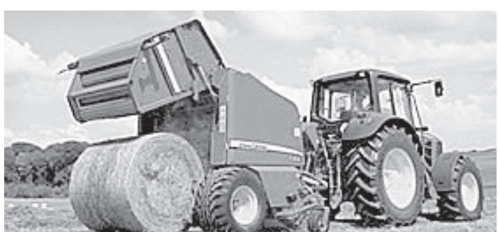
Beef Moooves John Deere!