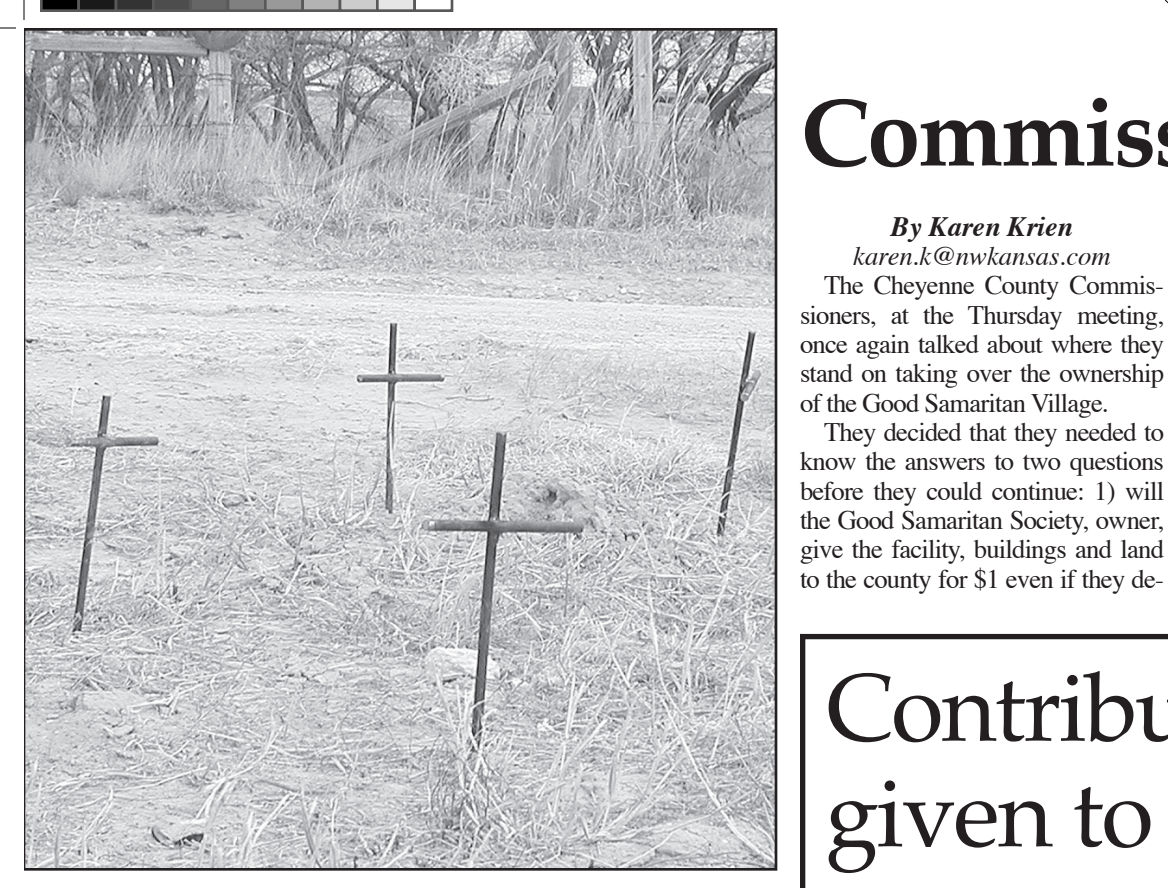
CROSSES at the intersection of Roads H, 2 and 3.