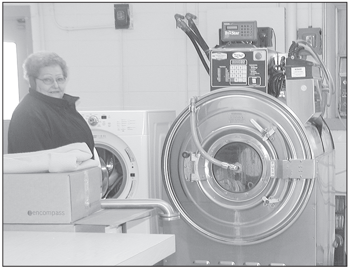
THE LAUNDRY DEPARTMENT (above) is cleaned and ready for use. Pictured at left, was the laundry room with piles of items needing to be washed after the fire.