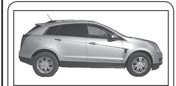
2010 Cadillac SRX, Silver, Leather, Sunroof

Due to the cold weather does your vehicle act like it caught a cold? When you try to start it, it just moans and then when it does fire up it starts to cough. Well you're in luck here at Vince's GM Center we have a Great Selection Of Pre-owned vehicles at a fair price.