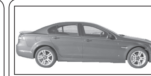
2008 Pontiac G8, Gray, Leather, Sunroof

thought to ponder.....How come thaw and unthaw mean the same thing?