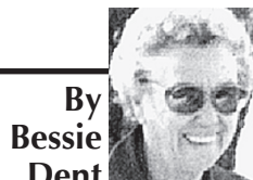
By Bessie Dent