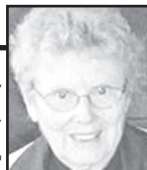
By Floy Fisher

A few patches of snow in shady places is all that remains of the approximately 7 inches of snow that blanketed Haigler earlier in the month. Several days of sunshine and temperatures in the 40s and 50s have been appreciated. Many Haigler residents have been enjoying the cold and snow by staying indoors, keeping warm.